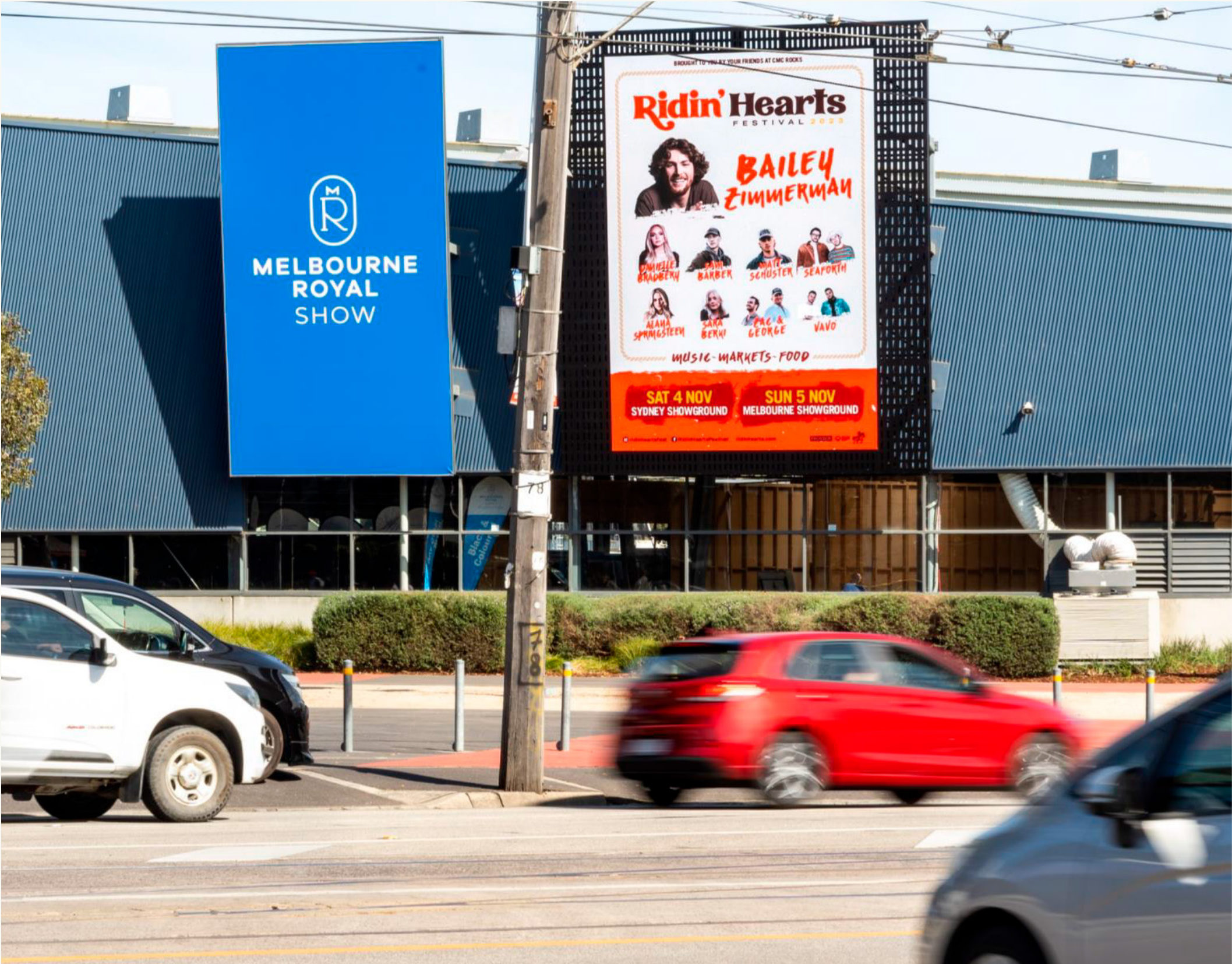
EAST – 5.1m x 7.7m, facing Epsom Road

Operating 6am-11pm daily, 20,000 passing cars per day (source: VicRoads)