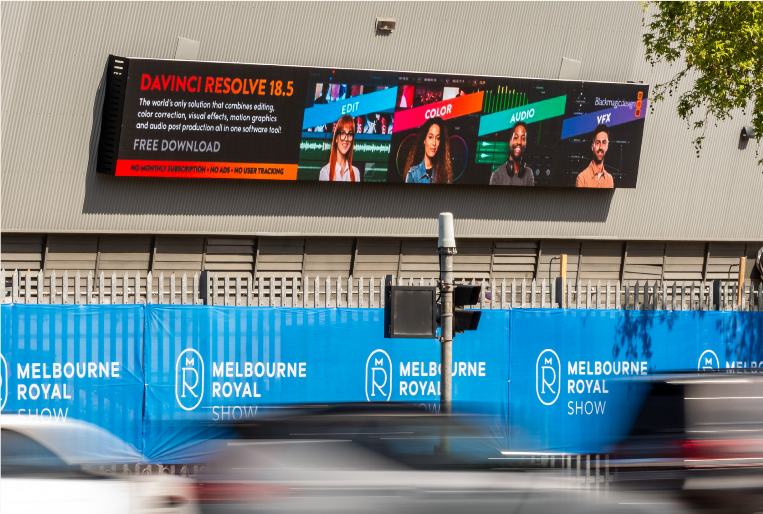
NORTH – 14 m x 1.9 m, facing Epsom Road